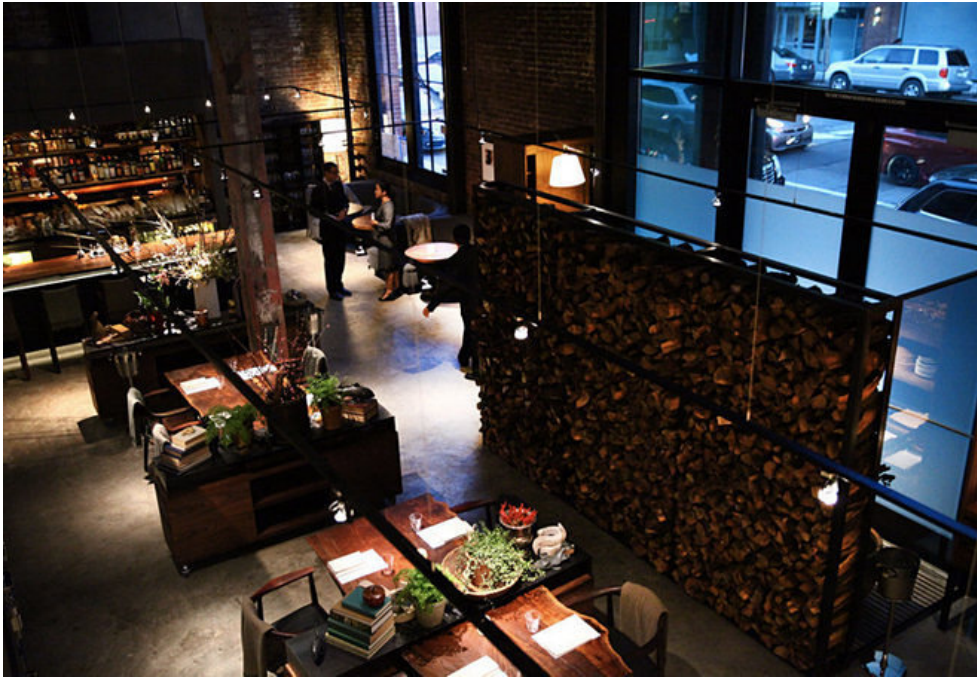
Saison, San Francisco.

Bonjwing Lee, photographer and blogger behind the Ulterior Epicure < http://ulteriorepicure.com/ > :