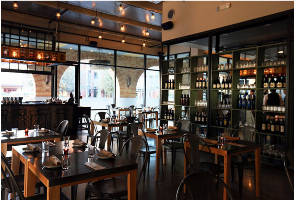
Arcade Midtown Kitchen, San Antonio.