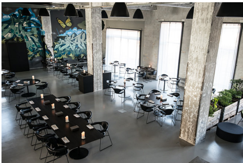
Amass, Copenhagen.

Lee Ho Fook , Valentino, and Pope Joan Dinners in Melbourne. Estela in New York.