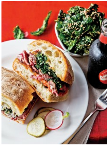
Butcher & Bee, on Upper King Street, specializes in "craft" sandwiches—like this roast beef with chimichurri