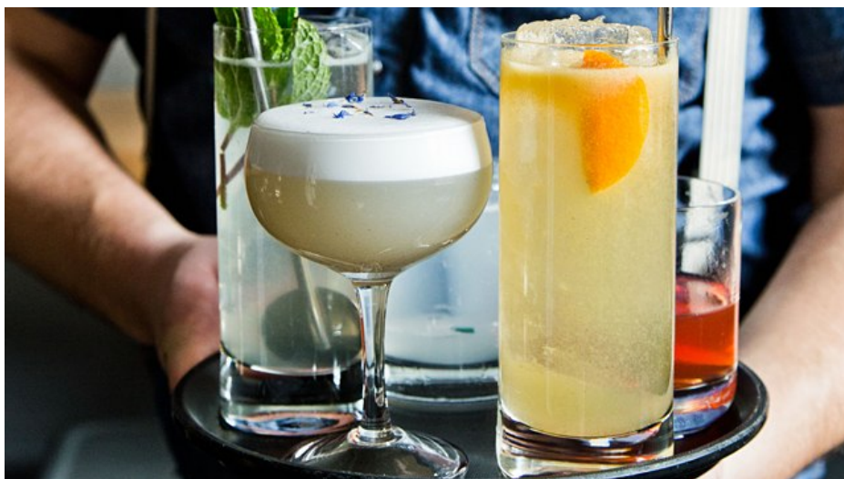
Cocktails at the Gin Joint are made with homemade syrups and locally plucked herbs, and the drinks menu changes with the season.

Where to stay, eat, and drink in Charleston, South Carolina, Condé Nast Traveler readers' top-rated city in the U.S.